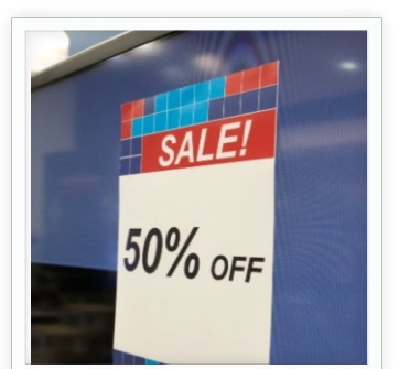
Flat screen TV