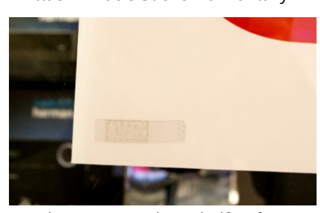
Apply sign to window, shelf or fixture